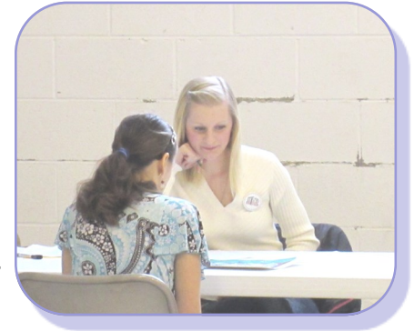
Interviews at Winter Achievement help 4-H'ers gain important life skills.